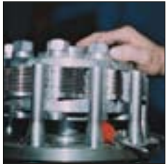
Our cutterhead makes well-finished joints